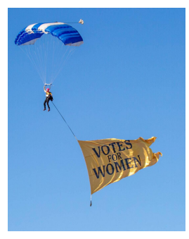
PROJECT 19 SKYDIVERS