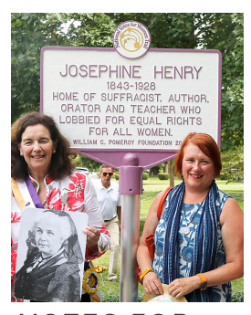
VOTES FOR WOMEN TRAIL