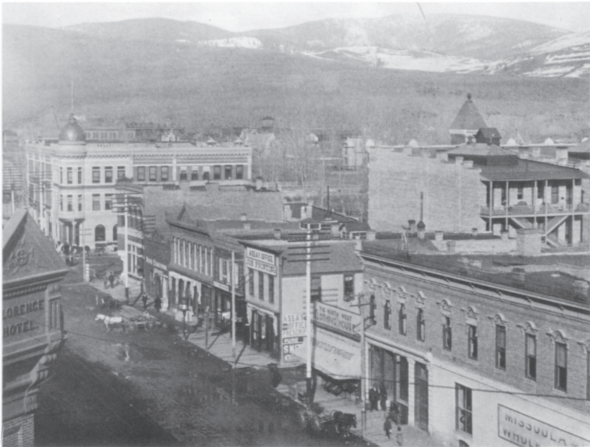
MAIN STREET OF "THE GARDEN CITY," CIRCA 1909