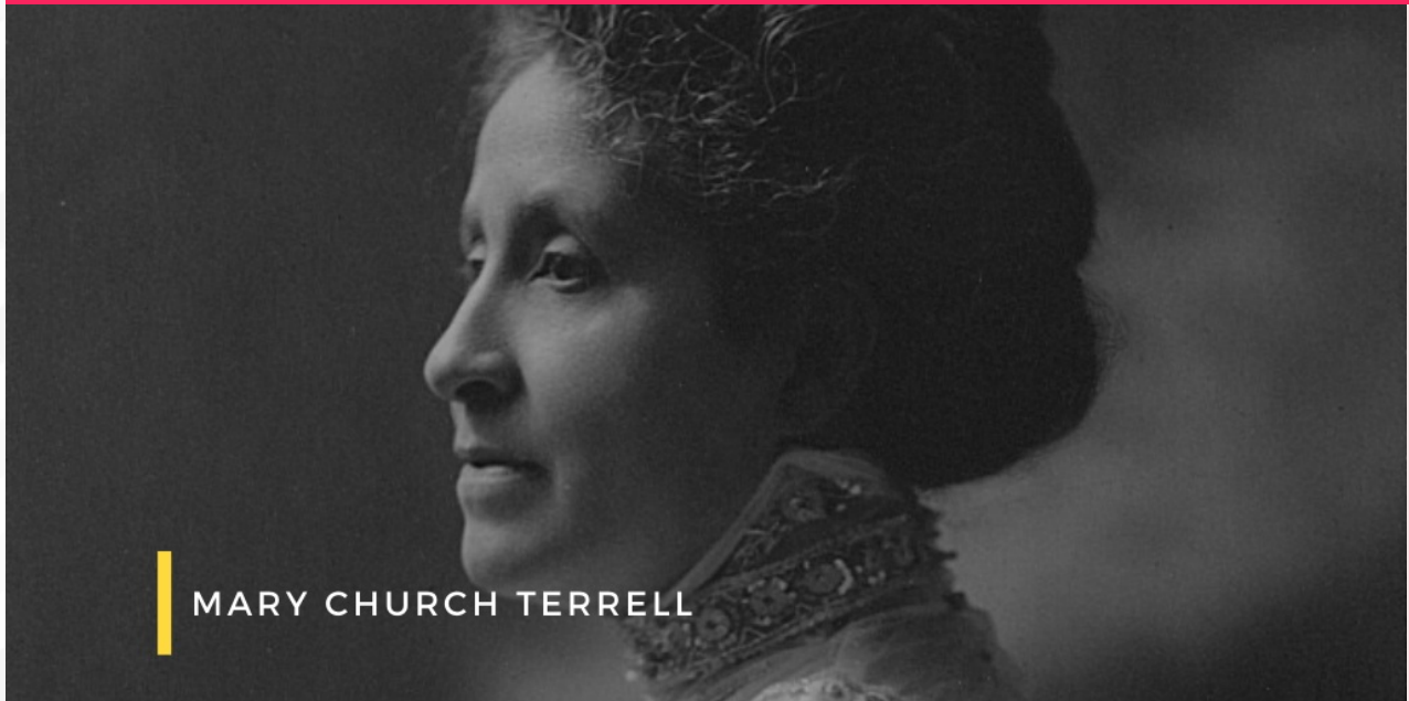
MARY CHURCH TERRELL