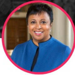
Dr. Carla Hayden Librarian of Congress