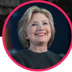
Hillary Rodham Clinton Former Secretary of State